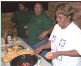
October 2006 First Edition